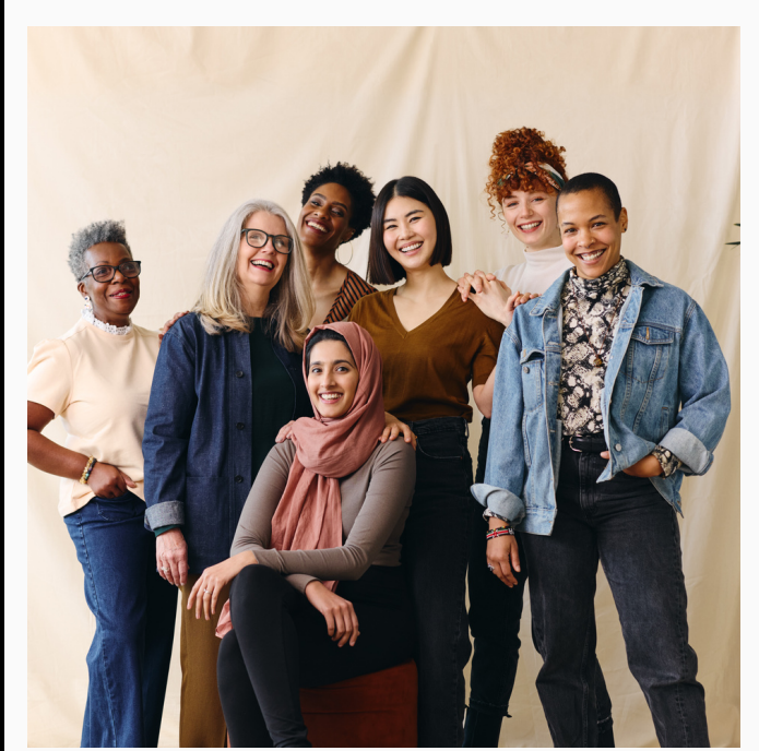
last reviewed October 30th, 2023